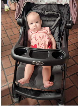
Future Eagle Rider?